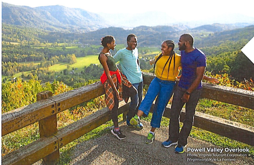
Powell Valley Overlook