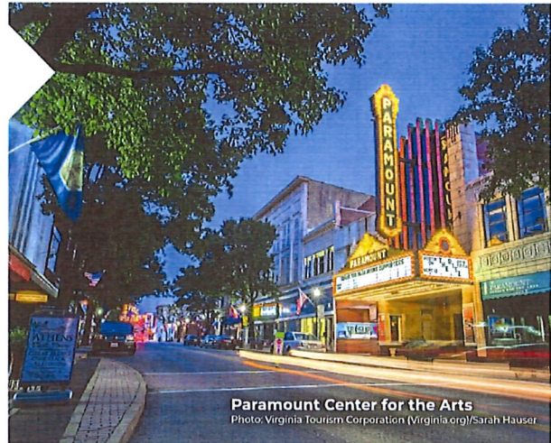
Paramount Center for the Arts